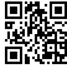
Clarksburg Library Naviance Sign Up